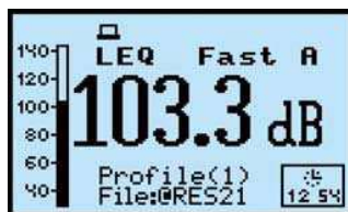
Main result in one profile view

**with USB 1.1 Host function not active and backlight off